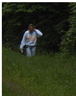
CANADICE LAKE TRAIL