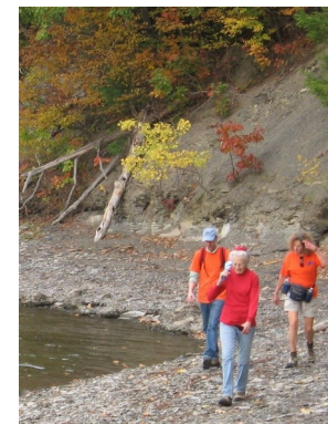
HIKING THE HEMLOCK SHORELINE

The fall is a wonderful season to hike. The bugs are gone and the leaves are changing. Many hikers want to be on the trail before the snow falls. Springwater Trails will continue to lead our weekly hikes during this season. Now is a good time to get out your orange vest, your orange hat and your orange backpack and join us on the trails.