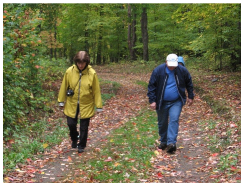
FALL COMES TO THE ALL WESTERN TREE FARM

Springwater Trails, Inc PO Box 162 Springwater, NY 14560